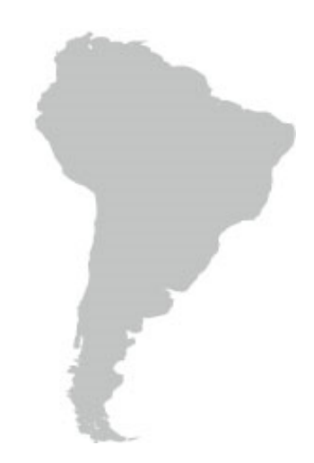
South America Net Sales Up & Operating Income Up