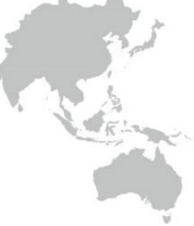
Asia-Pacific Net Sales Down & Operating Income Flat