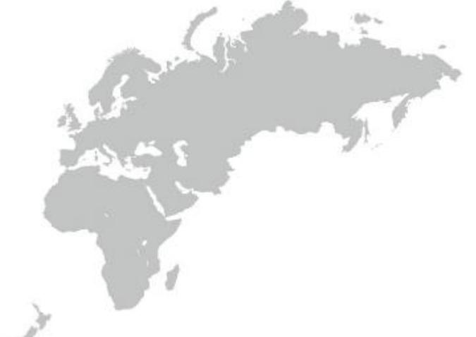
EMEA Net Sales Flat & Operating Income Up