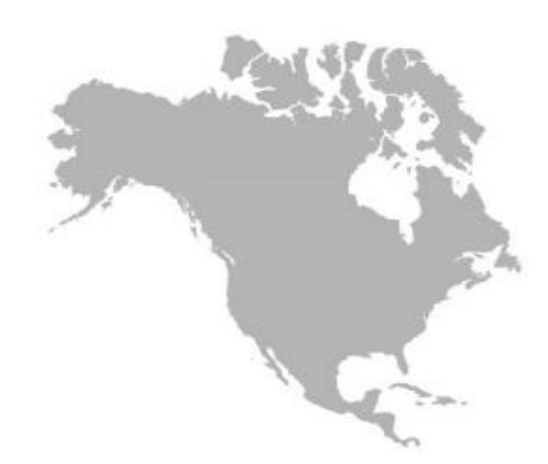
North America Net Sales Up & Operating Income Flat